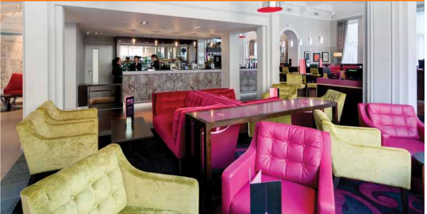
HOTEL INDIGO GLASGOW

Hotel Indigo features unique design at every turn, without compromising our guest's comfort. Plush bedding, spa-style bathrooms, hard surface flooring, and the use of renewable resources make for an environmentally conscious, yet visually appealing décor.