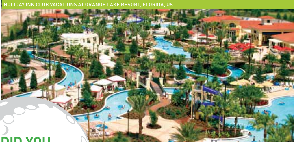
HOLIDAY INN CLUB VACATIONS AT ORANGE LAKE RESORT, FLORIDA, US