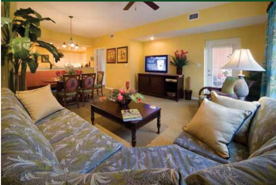
HOLIDAY INN CLUB VACATIONS LIVING ROOM